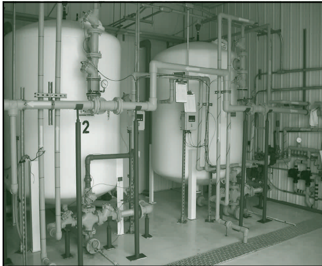
Village of Bloomdale water treatment plant

Administration, Customer Service, and Operations: