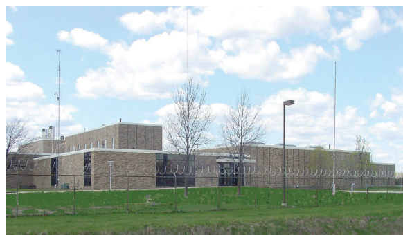
City of Oregon Water Treatment Plant

Administration, Customer Service, and Operations: