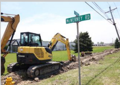
Above: Construction of the waterline installation at the intersection of Tracy and McNerney roads