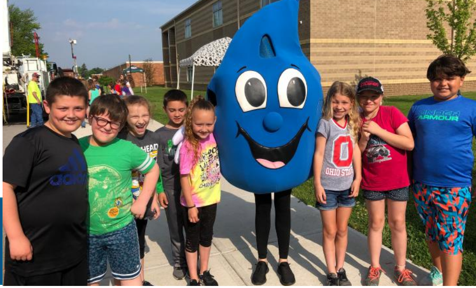
Above: Our mascot poses with friends from Eastwood Elementary at their Vehicle Career Day. The kids explored the vacuum truck and got to learn about The District!