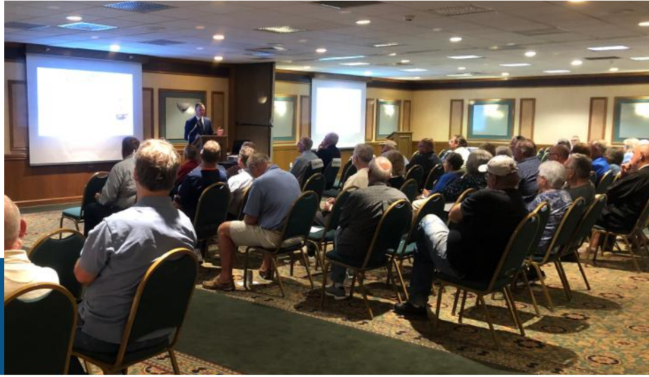
Above: The District held its fourth informational meeting regarding regional water options for our 6,500 customers supplied with water from the City of Toledo. See article below for more information.