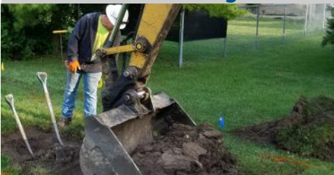
Crews continue to work to relocate meters in Weston. Customers in the village will be notified of water service shut-offs. For more information go to NWWSD.ORG .