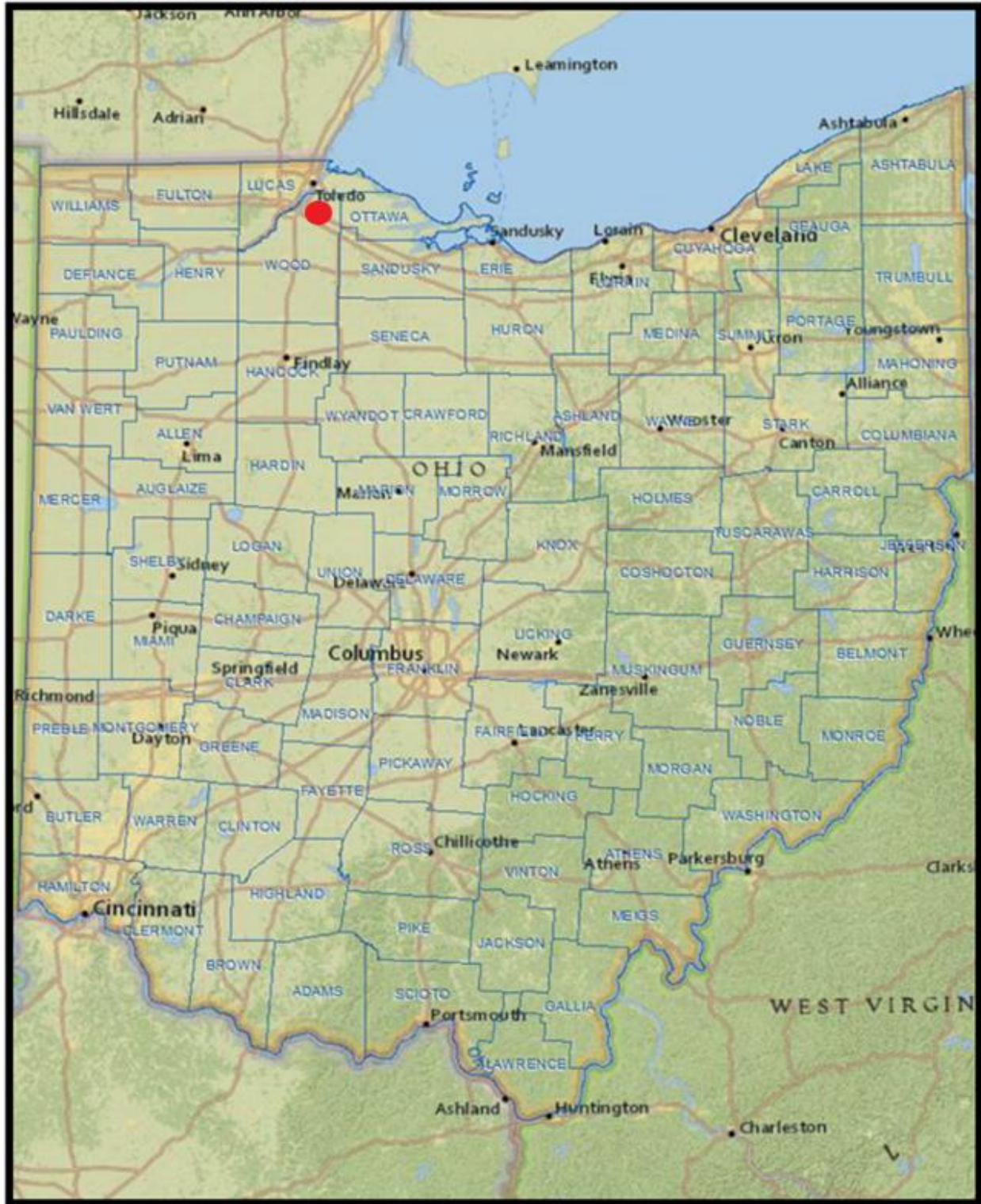
Figure 1: Project general area, in red