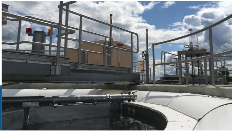
Pictured above: A clarifier located at the new South East Water Reclamation Regional (SEWRR) Facility in Bloomdale, Ohio. The facility serves two villages, Bairdstown and Bloomdale, ensuring clean water for both communities and the Lake Erie Watershed.