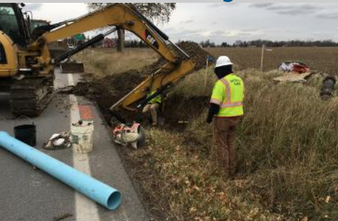
The above photograph was taken in December along State Route 64/65 near the Waterville Bridge. Crews relocated a waterline to make way for construction of a new roundabout and bridge. Work is now complete, but this spring, The District will begin another waterline relocation project to make room for a roundabout at the intersection of Lime City and Buck Roads.