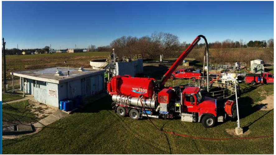
Above: Maintenance crews winterize the McComb wastewater treatment plant. The District continues to make low-cost improvements to the 70 year-old plant. The District hopes to start construction of a new plant this year. For more on this project, see Page 2.