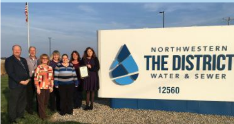
Above: In November, The District was presented with the Auditor of State Award with Distinction and the award for Excellence in Financial Reporting by the Government Finance Officers Association of the United States and Canada for the 2016 Comprehensive Annual Financial Report.